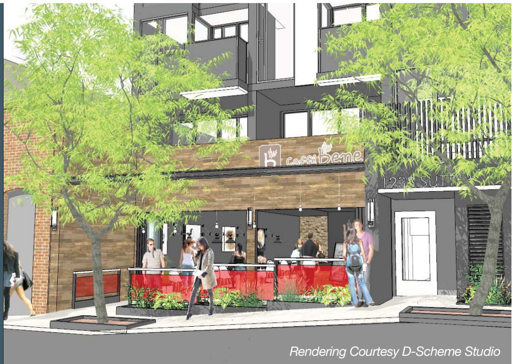
Rendering Courtesy D-Scheme Studio