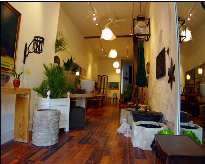
1228 Sutter Street, pictured after renovation