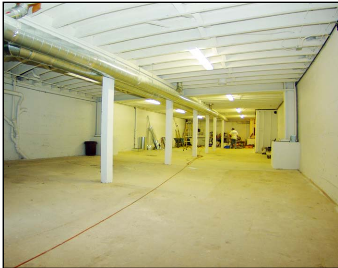
Clean and renovated basement